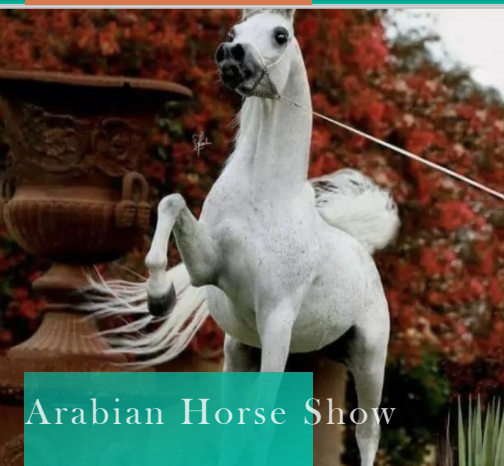
Arabian Horse Show