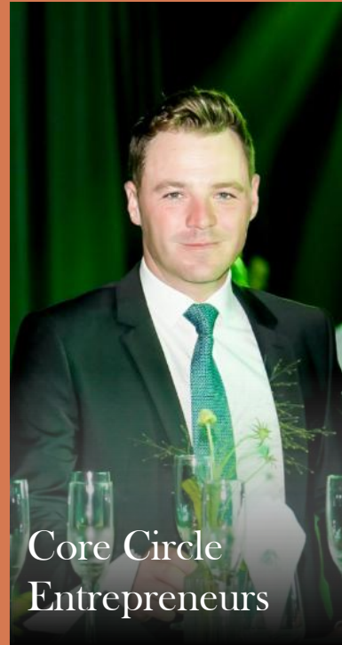
Core Circle Entrepreneurs

Lifestyle & Trend Leaders Super Active on Social events Strong Consumer