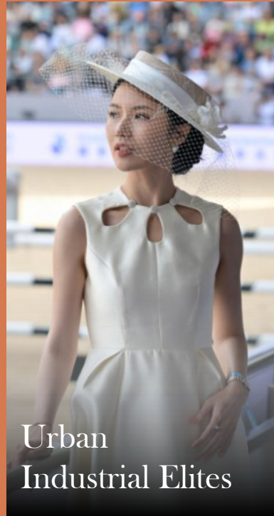
Urban Industrial Elites

Experiential Consumer Elite Education High Loyalty